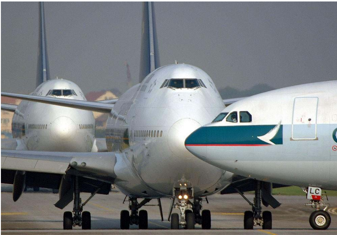
Picture 1.1 - Busy day at an airport

The most serious threat is when an aircraft, vehicle, or pedestrian enters an active runway, which results in a loss of separation, or even worse, a collision. These types of incidents/accidents are referred to as Runway Incursions and have become one of the most highlighted issues in civil aviation today. The situation at major airports today is highly complex and a taxiing "road system" with confusing traffic lights and signs that sometimes are difficult to interpret.